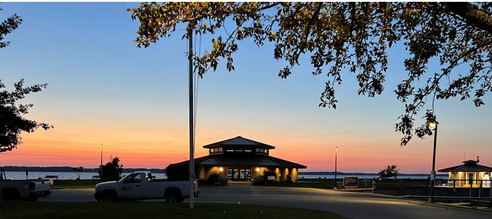
Sunset over the Jack Blesma Pavilion

The Village of Elk Rapids reserves the right to reject any or all proposals for this service and is not limited to the lowest bid.