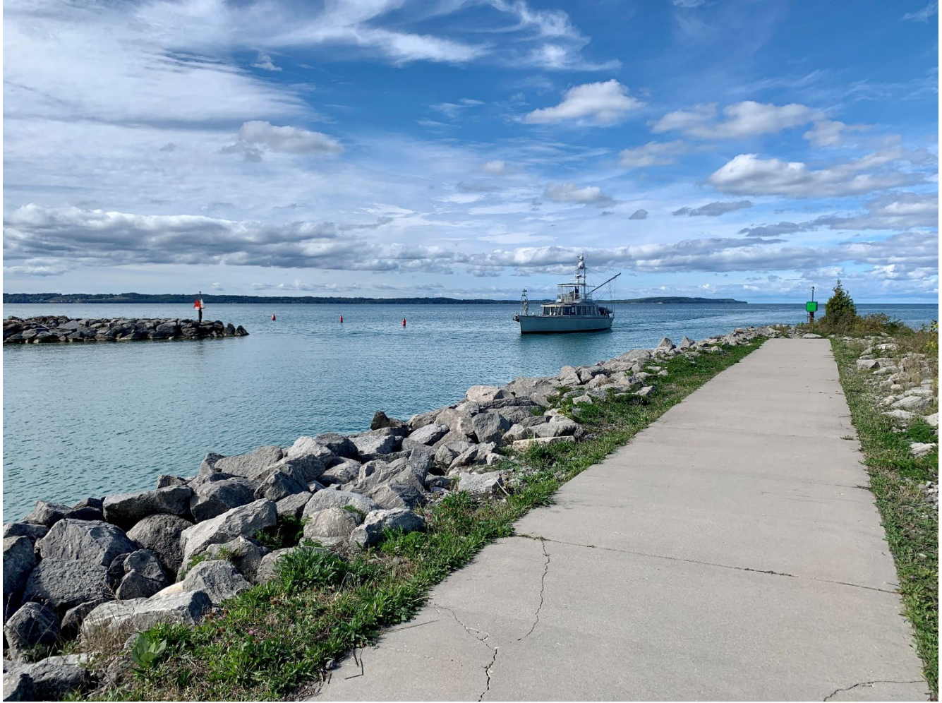
Harbor entrance that will need to be dredged.