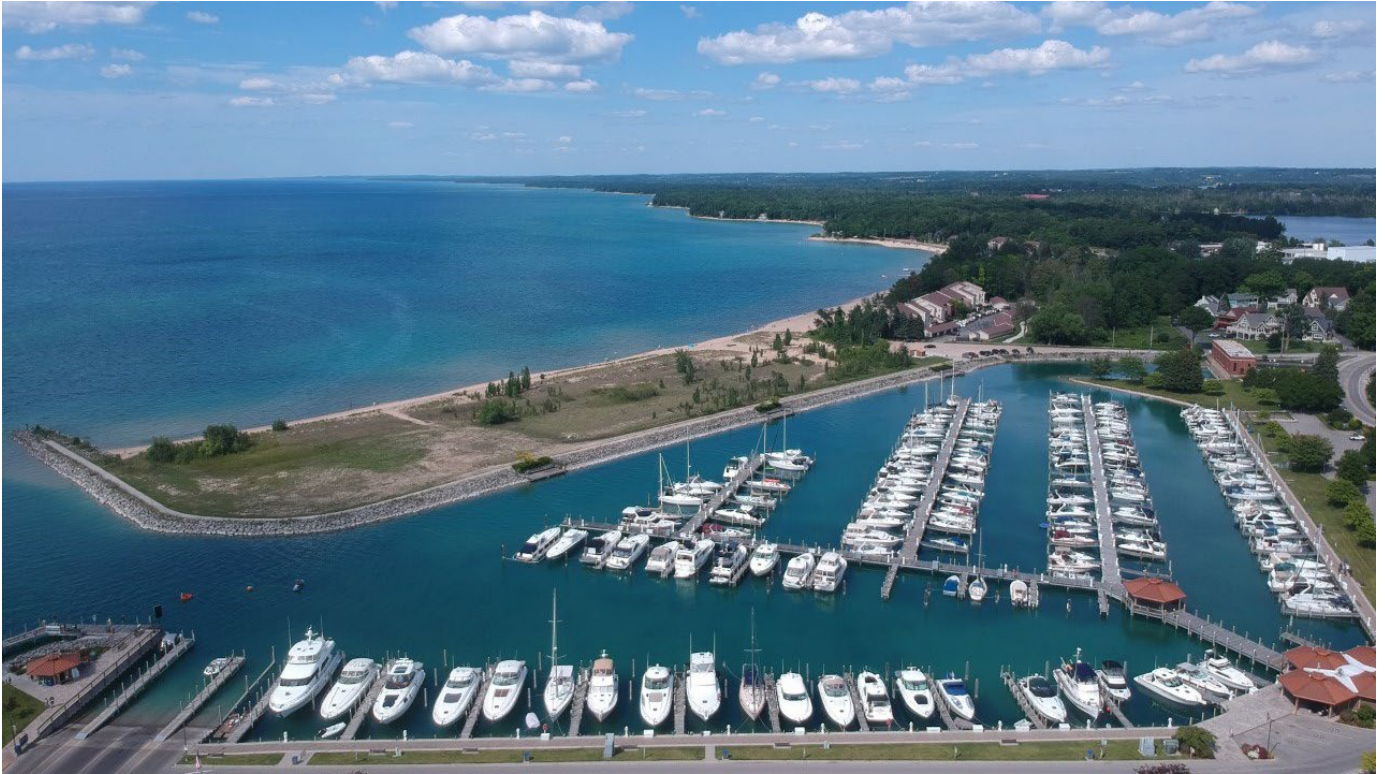
Aerial view of the Edward C. Grace Lower Harbor.