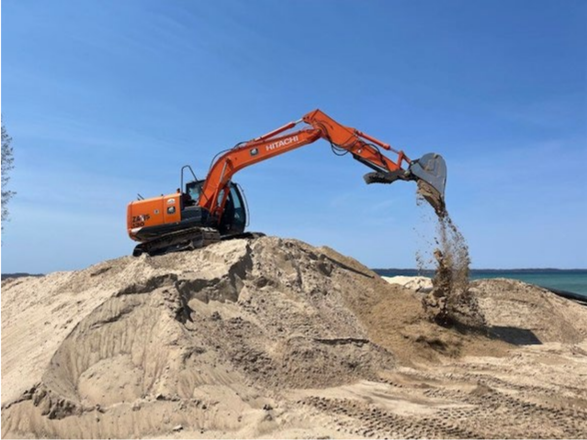
Excavated trench on Elk Rapids' Veterans Memorial Beach.