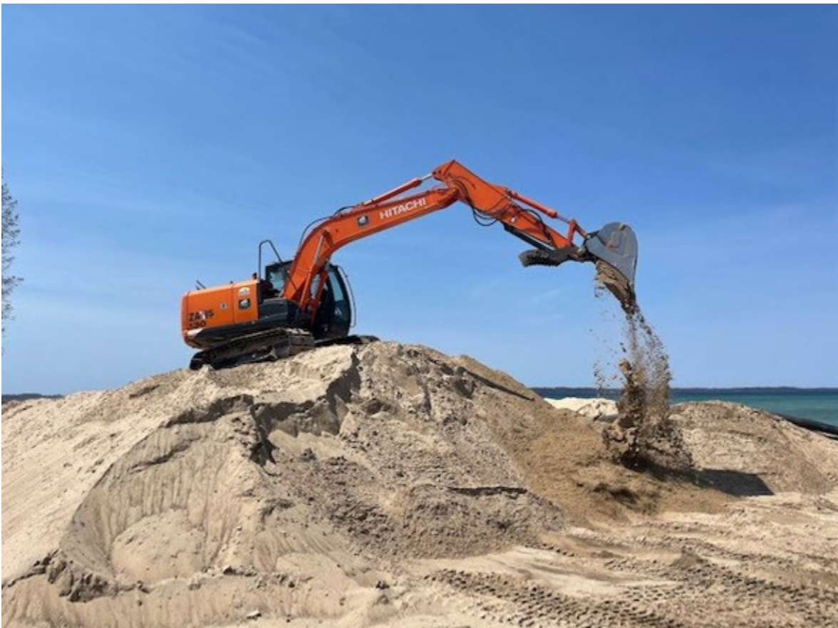
Figure 2: Dredge spoils on Elk Rapids' Veterans Memorial Beach.