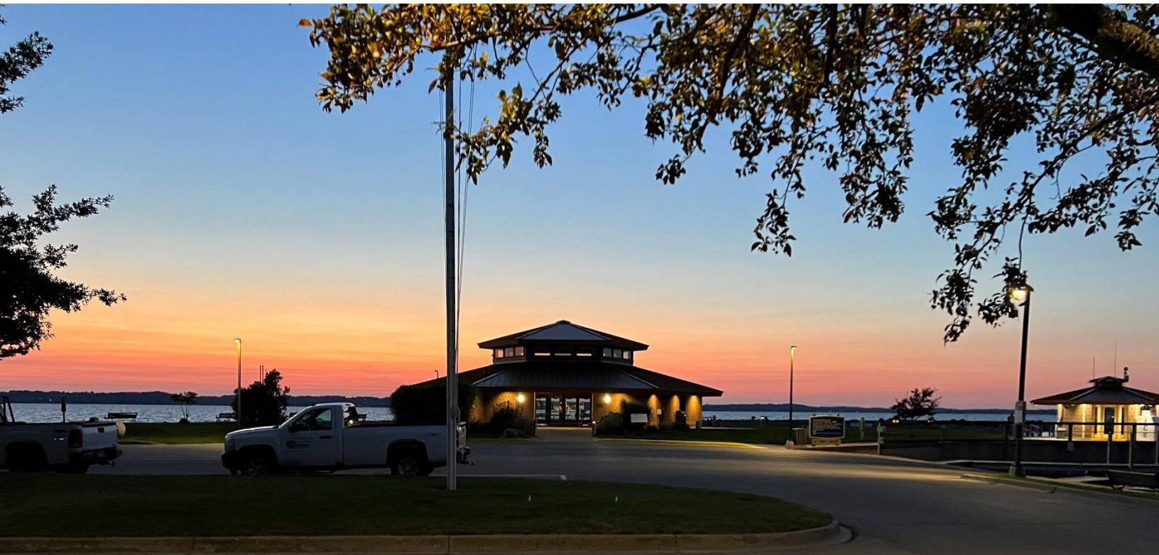
Figure 4: Sunset over the Jack Blesma Pavilion.

The Village of Elk Rapids reserves the right to reject any or all proposals for this service and is not limited to the lowest bid.