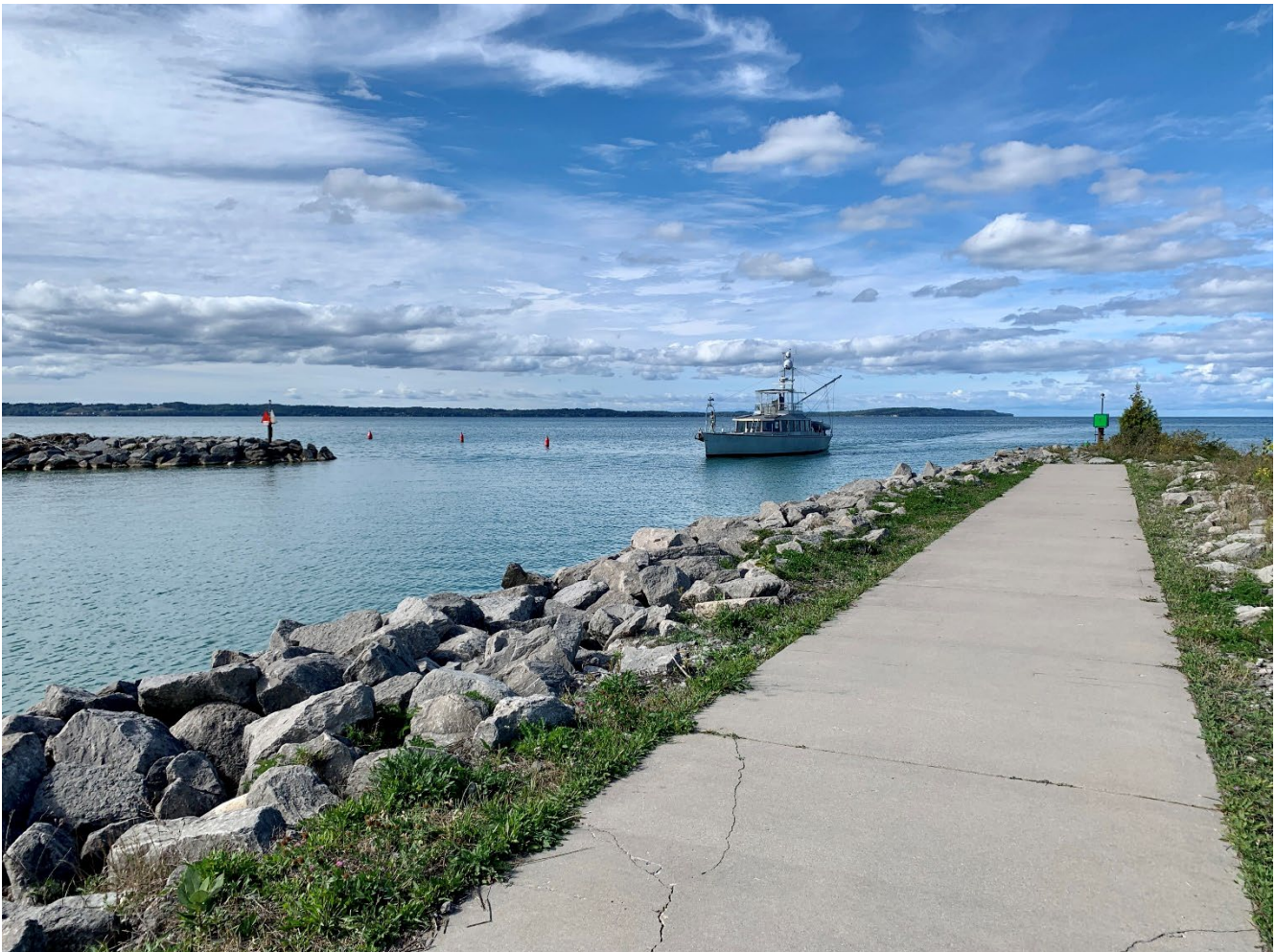
Figure 3: Harbor entrance that will need to be dredged.