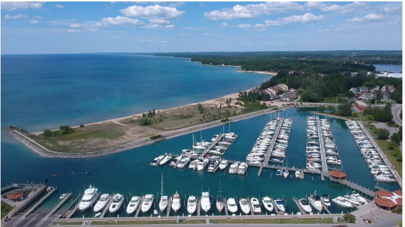
Figure 1: Aerial view of the Edward C. Grace Lower Harbor.